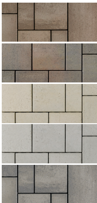
Smooth Chestnut Brown Smooth Champlain Grey Smooth Beige Cream Smooth Greyed Nickel Smooth Shale Grey